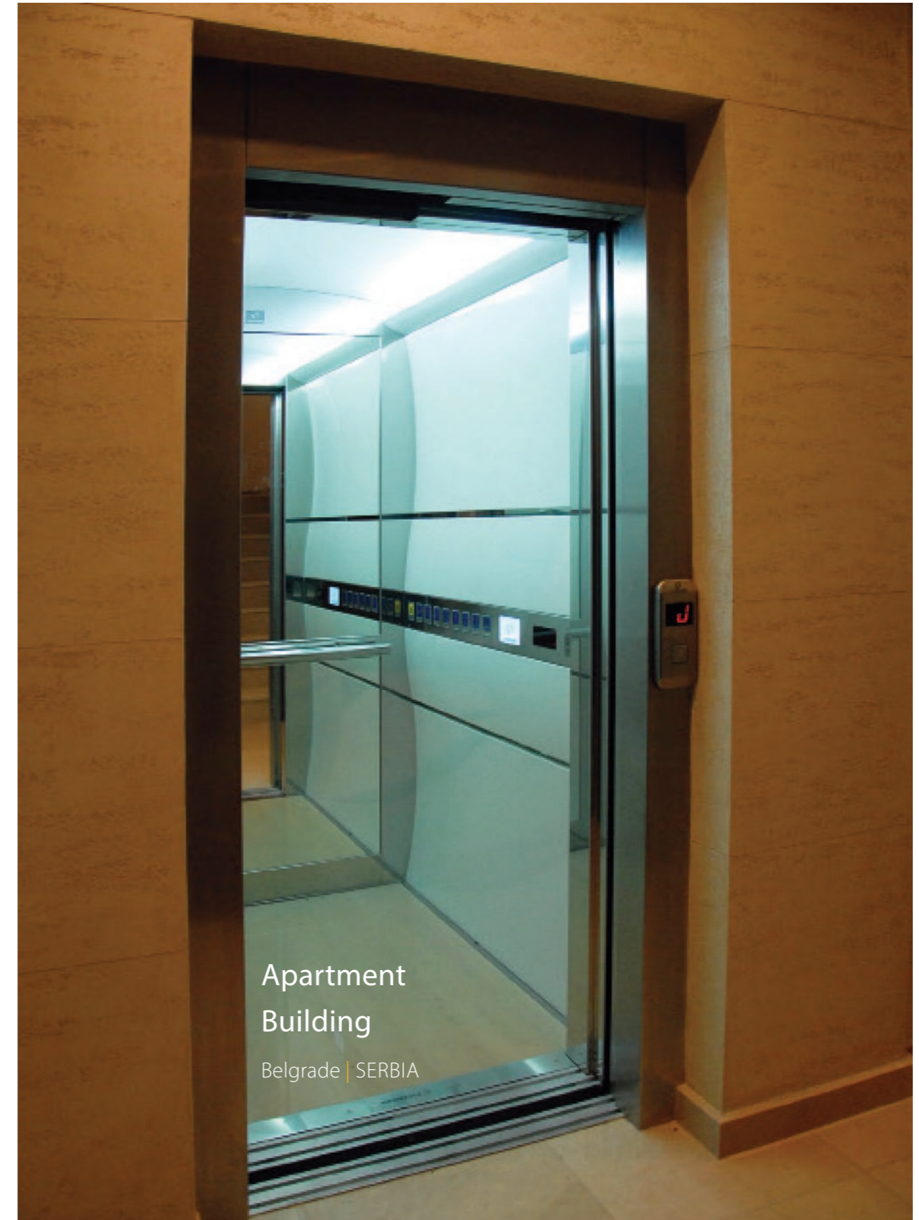
Apartment Building Belgrade | SERBIA